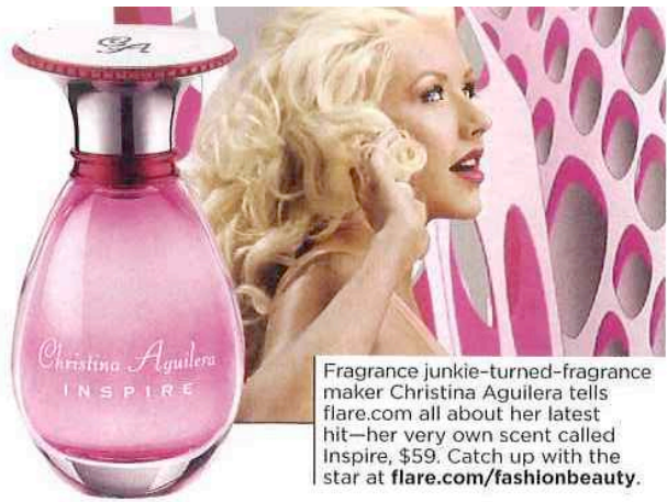
Fragrance junkie-turned-fragrance maker Christina Aguilera tells flare.com all about her latest hit—her very own scent called Inspire, $59. Catch up with the star at flare.com/fashionbeauty .