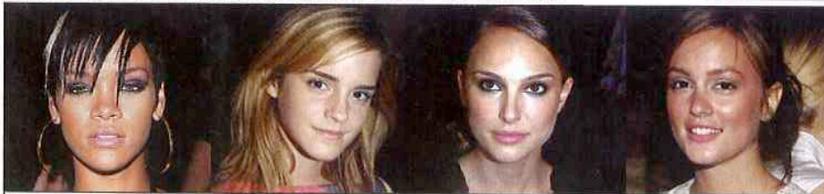
RIHANNA AT GUCCI THE LOOK: SEXY THE MUST-HAVE: COVERGIRL EYE ENHANCERS EYE SHADOW IN SHIMMERING ONYX, $5.

WE ROUNDED UP THE BEST BEAUTY LOOKS FROM THE FRONT ROW DURING THE SPRING '09 SHOWS