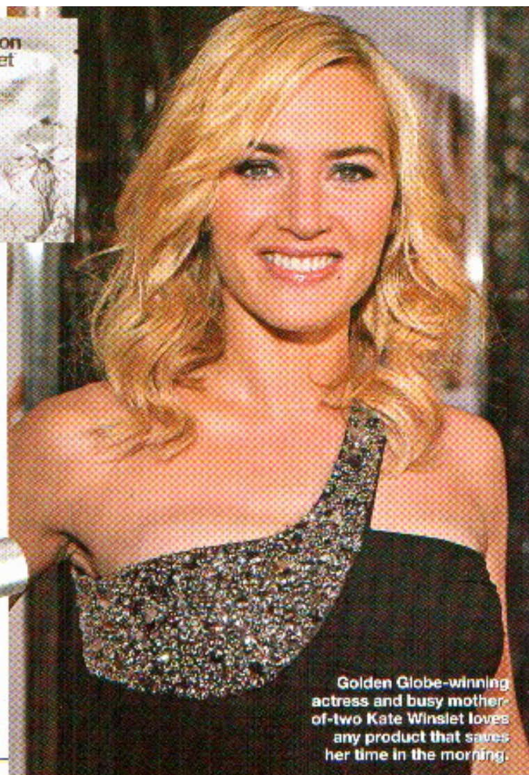
Golden Globe-winning actress and busy mother-of-two Kate Winslet loves any product that saves her time in the morning.