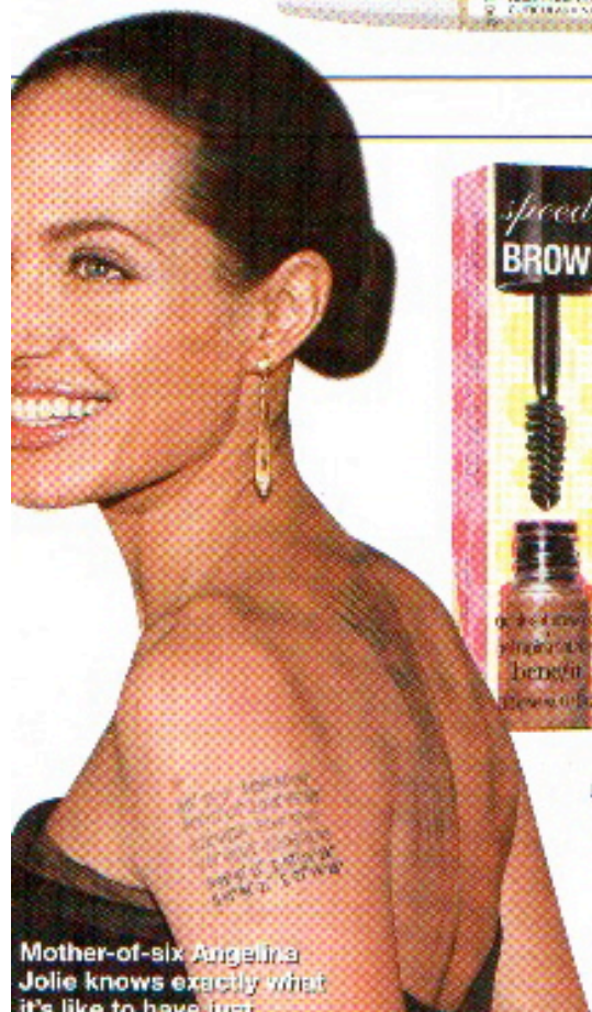
Mother-of-six Angelina Jolie knows exactly what it's like to have time