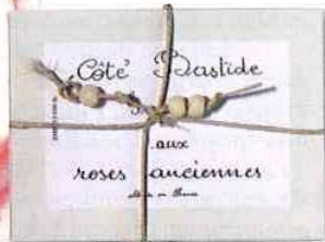
ABOVE, CÔTÉ BASTIDE ROSES ANCIENNES SOAP; LEFT, CHANTECAILLE RÊVE DE ROSE LIP GLOSS COMPACT; BELOW RIGHT, FRESH SUGAR ROSÉ TINTED LIP TREATMENT SPF 15.