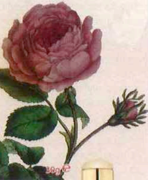
LEFT, LCDP WILD ROSE FOAM BATH; RIGHT, YSL PARISIENNE.