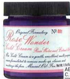
ABOVE LEFT, C. O. BIGELOW ROSE WONDER COLD CREAM; BELOW, SULA ROSE BALM.